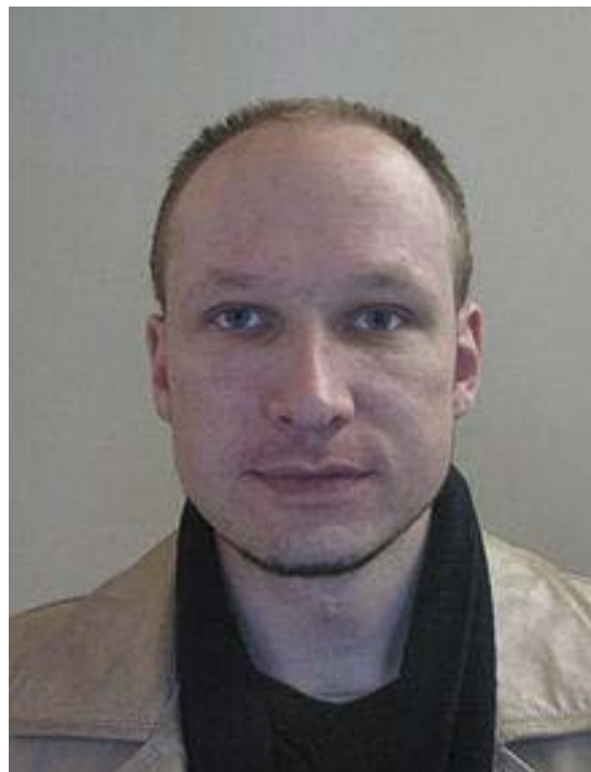
Illustration. In 2011, Anders Brevik killed 8 people using a bomb in central Oslo (Norway) then drove to a youth camp on the Island of Utoeya, where he shot dead a further 69 people. He admitted his acts and stated he had done so for political purposes.