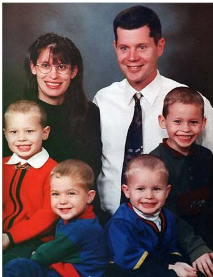
Illustration. The only details available on this case, on the other side of the world (to Australia), come from two brief newspaper reports.