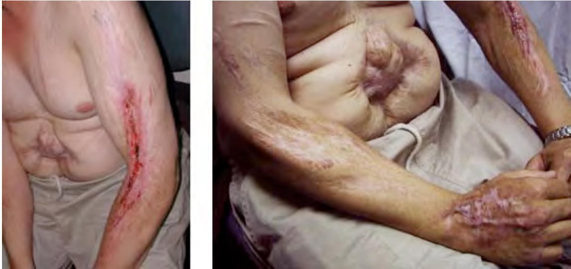
Figure 12. The hands arms and abdomen of a self-mutilating man with a long history of borderline personality. He kept a 30 cm lesion on his left arm permanently open. The edges and the base of the lesion were scarred and indurated. He burnt the dorsum of his right hand and there was muscle tissue loss of his right forearm from repeated injury. There were scars on his upper chest which are not well illustrated in these photographs. In the past he has swallowed razor blades which had perforated his bowel, leading to abdominal surgery. He had repeatedly removed the stitches and recut his abdominal scar, leading to a large incisional hernia. (The bulging in the middle of his abdomen is abdominal organs pushing against scar and skin, the muscle wall of his abdomen having been self-damaged.)

In recent times, self-mutilation has been fashionable among non-psychotic individuals in Australian prisons. One notorious Australian prisoner (murder) earned the nickname 'Chopper' by cutting off his external ears. Such mutilation creates a frightening appearance, but the motivation probably varies with the individual and may include initiation/belonging to a group and self induce punishment, among others. Some decades ago the shaving of the head and tattooing on the face and neck might have been considered low level self-mutilation, but they are now fashionable.