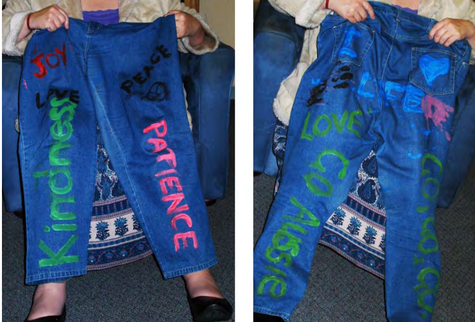
Figure 7. A middle aged woman was admitted to a psychiatric ward in a manic state. While on the ward she used acrylic paint to put the words “kindness, joy, peace, patience” on the front, and “I love (indicated by symbol of a heart) life”, “Love” and a patriotic slogan on the back, on a pair of expensive new jeans. She then wore these with confidence.

Self-neglect of recent onset as when a patient presents in relatively new and expensive clothes but with food stains on the front or smelling of urine and body odor may suggest an organic disorder such as rapidly progressing dementia, or very rarely, severe depression with psychomotor retardation.