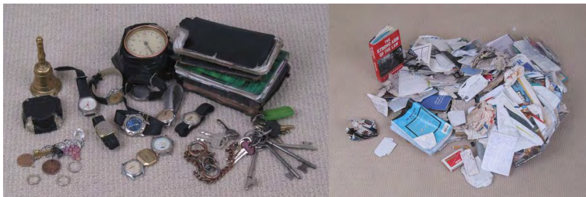
Figure 13. A man of no fixed abode apparently suffering from schizophrenia was admitted to hospital. His only belongings were in a bag he carried in his hand. In the picture on the left are items which appear to have some value. Among them were 10 watches, all old and broken, two dials (the sort which registered pressure or temperature on old machines) a brass bell, a small stack of notebooks (all empty), a couple of foreign coins, some single earrings and about 20 keys (to unknown locks). In addition, the bag contained (shown on the right) a large quantity of pamphlets, notes, shoelaces and matchboxes, which appeared to have no value whatsoever. The only book was entitled "The Strong Arm of the Law". It

Hoarding is the acquisition of or inability to discard items which appear (to others) to have no value (Frost & Gross, 1993). There may be a fine line between 'collecting' and 'hoarding'. In hoarding there is often chaos and the hoarded items may limit individuals in living their lives. From time to time we see TV shows about people who have cluttered their houses with valueless items to such an extent that they cannot enter rooms, and the neighbors complain when the yards become so cluttered with "rubbish" that rats take up residence and cause a public health hazard. This may be seen as a matter of civil liberty and choice. In mental disorders, hoarding is often seen in obsessive compulsive disorder, eating disorders, dementia and low intelligence and schizophrenia.(Figure 13)