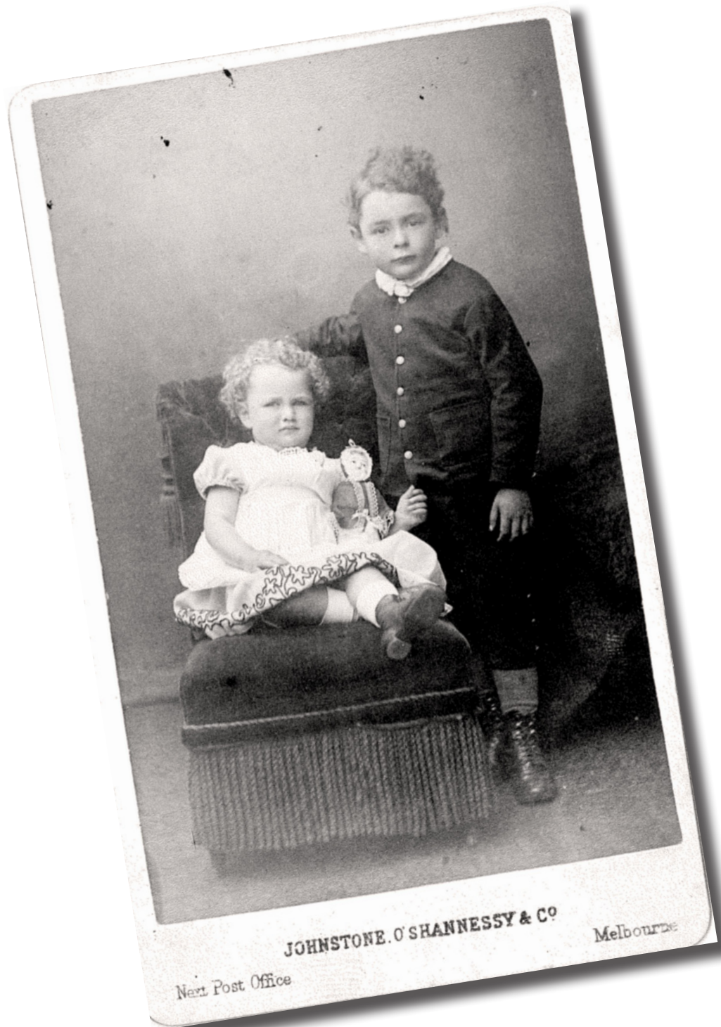
JOHNSTONE, O'SHANNESSEY & CO Next Post Office Melbourne