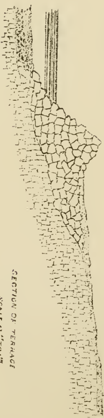
SECTION OF TERRACE SCALE 2" = 100'