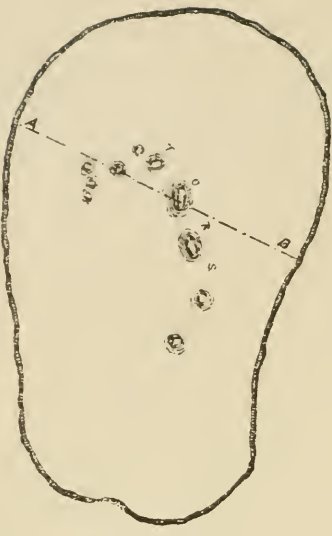
PLAN, ENLARGED 12 TIMES FROM 1/4" = 1 MILE MAP