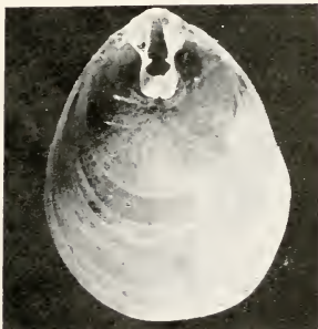
Fig. 5 (2.5 x)