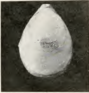
Fig. 1 (2 x)