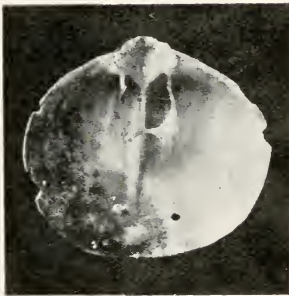
Fig. 9 (3 x)