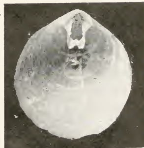
Fig. 6 (2.5 x)