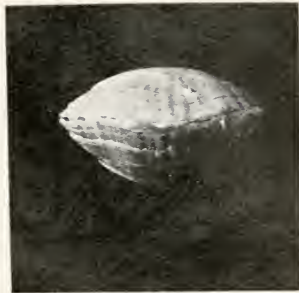
Fig. 8 (3 x)