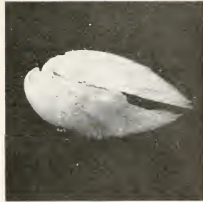
Fig. 2 (2 x)