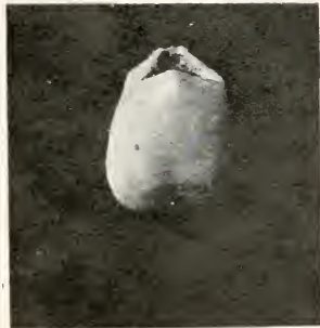
Fig. 10 (8 x)