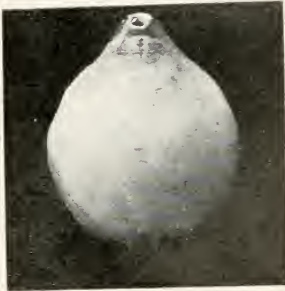
Fig. 3 (2 x)