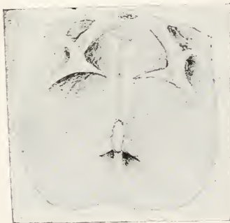
Fig. 11 (16 x)