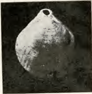
Fig. 7 (3 x)