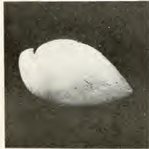
Fig. 4 (2 x)