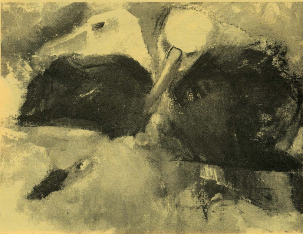
PREENING WHITE CAP PAIR 1977