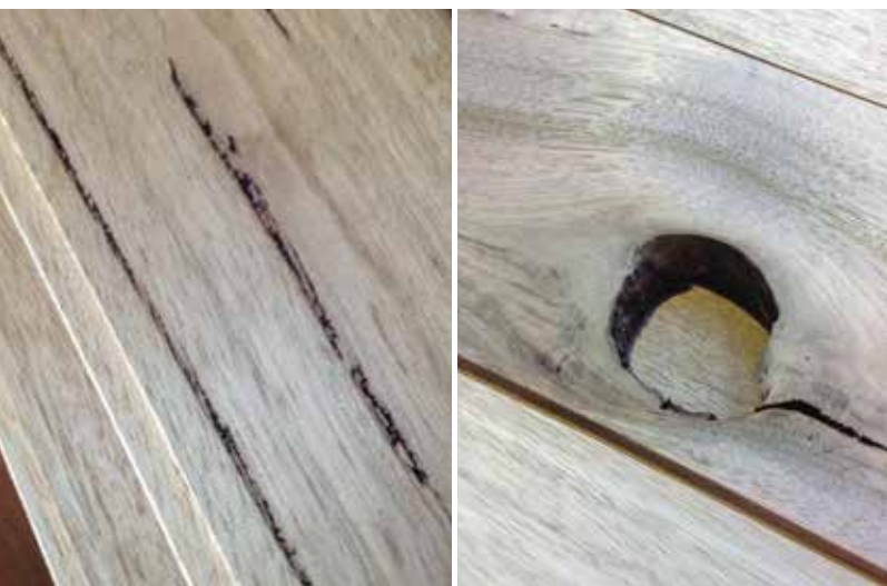
Natural features – gum vein and loose knot