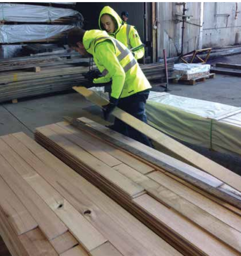
Board assessment and collecting data – feature type and quantity

This study identifies the importance for industry processors to investigate timber packs regularly to identify avoidable non-permissible features caused by processing practices, a lack of reflection on production and due diligence. This case study also demonstrates the importance of identifying which timber features are avoidable during the production stage, regardless of the standardised grading method and timber species, to prevent low product recovery.