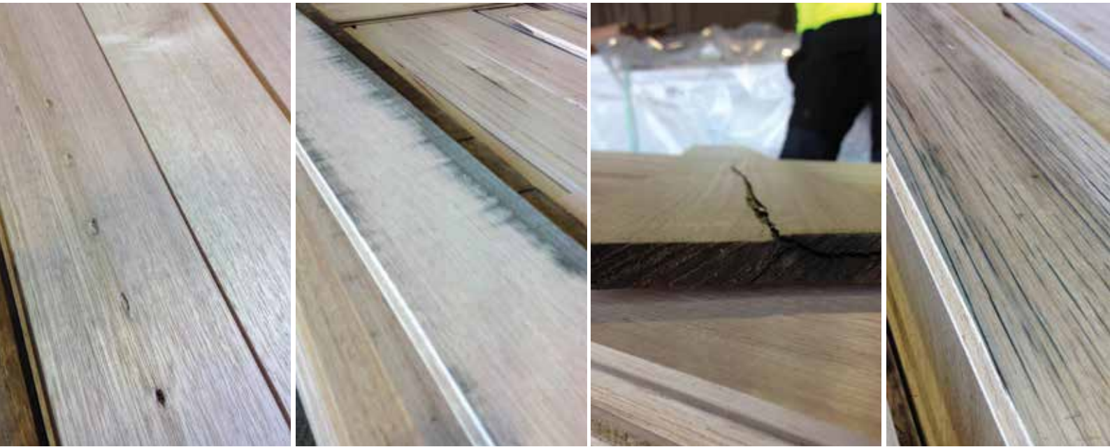
Processing-induced features – mechanical, hit and miss, split and check

Natural features should be managed and segregated into appropriate product streams that allow grade-reducing features for products that are not intended for appearance applications, or industry grade systems developed for markets that will accept such features in an area where they are desirable or specified.