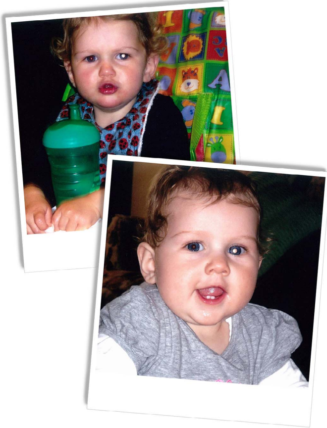
Figure 1. Images used in the online survey. Participants were informed that they had taken these photographs of a family member on separate occasions and then were asked to search the Internet for information about their observations.

book users over the age of 18 years and no financial or other rewards were offered to encourage participation. Information about the study was provided, with consent implied when the participant elected to complete the online survey. Basic demographic data were collected including: age, sex, geographic location, parental status, and healthcare background.