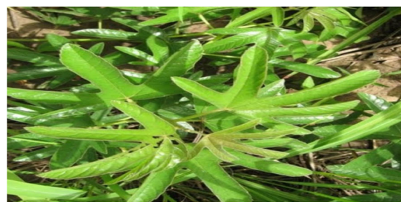
Fig. 1 The plant Cochlospermum tinctorium in its natural habitat adopted from [11]

The plant C. tinctorium belongs to the family Cochlospermaceae. The family consists of seven genera which include Amoreuxia , Azeredia , Cochlospermum , Euryanathe , Lachnocistus , Maximiliana , and Wittelsbachia [7]. The genus Cochlospermum Kunth (syn. Maximiliana Marth., Bixaceae) consists of some tropical species such as C. tinctorium , C. planchonii , C. angolense , C. vitifolium , C. regium , C. orinocense , C. religiosum , C. gillivraei , C. wittei , C. tetraporum , C. intermedium , and C. fraseri [8]. The two species C. planchonii and C. tinctorium are widely available in West Africa [9]. The plant C. tinctorium is a sub-shrub which is about 80 cm in length with a woody subterranean root stock that produces its shoots annually [10]. The leaves of the plant are alternate with lobes lanceolate to oblong, basally connate for up to 25% of their length [10]. The plant possesses few inflorescences and flowered panicle or raceme, usually produced at ground level from the rootstock, sometimes appearing on top of leafy shoots [10] (Fig. 1). The fruits of C. tinctorium are elongated about 3–5 valve and its capsules containing seeds are embedded in the cotton foam. The seeds are colored ranging from brown to black with a bean-shape. The endosperm of the plant is oily with broad cotyledon [12].